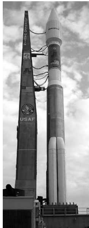
NASA satellite launches using NRG control systems.

In the greater community, he has been an active volunteer for several organizations. He supports the American Red Cross, the YMCA, the National MS Society, United Cerebral